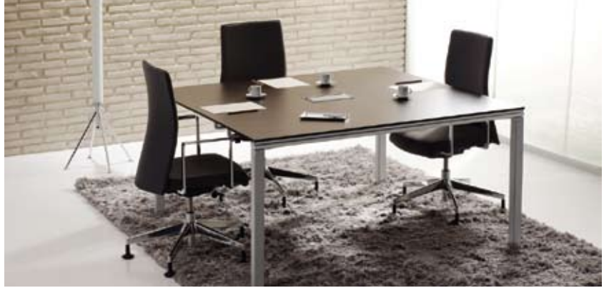
Muga Thin Upholstered Chair